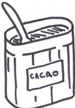
poudre de cacao