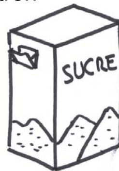
sucre en poudre